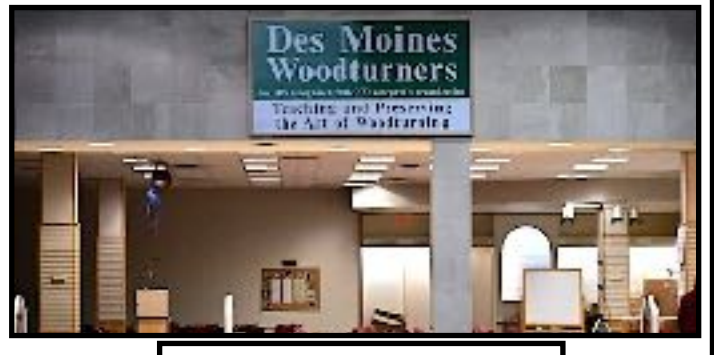
View of Inside Entrance