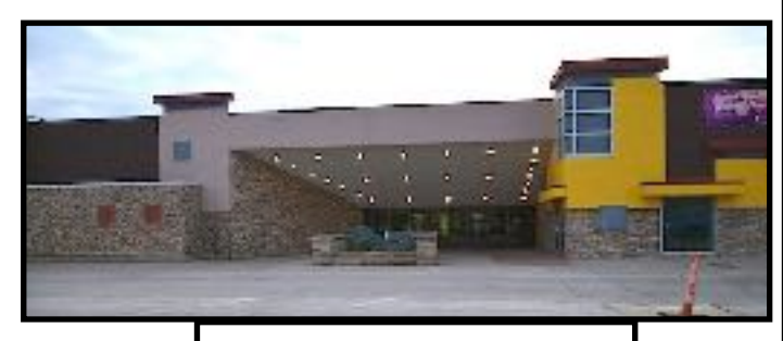
View of Outside Entrance